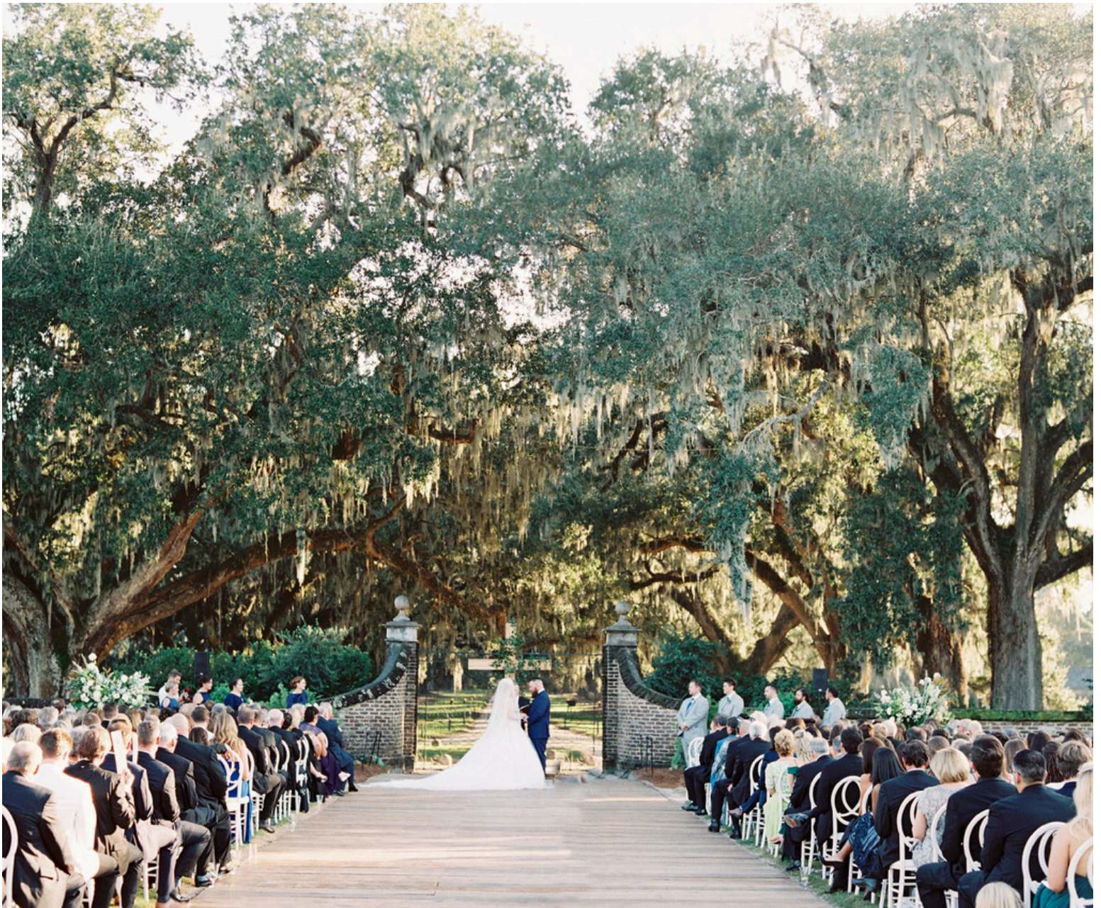
Event Design: Tailor & Table

The Front Lawn is the majestic lawn in front of the Plantation House. It has views of the Plantation House, the beautiful gardens surrounding the house, as well as the Oak Lined Avenue. This makes a lovely space for a ceremony or a cocktail hour. The black benches in front of the Plantation House can seat up to 60-70 people. There is plenty of additional room to add chairs if needed. Restrooms are conveniently located behind the Plantation House near the parking. Tents are not permitted on the Front Lawn. Set up may begin at 3:00pm with the event to start after the Plantation closes.